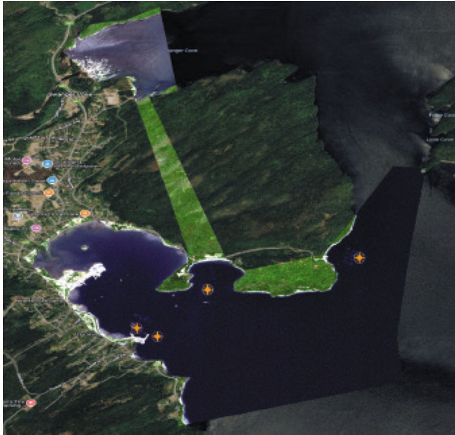
The extent of Maxar imagery for the Man Of War analysis site. The Man Of War, St Alban's Wharf and Lou Cove licensed aquaculture sites are denoted by the orange crosses.