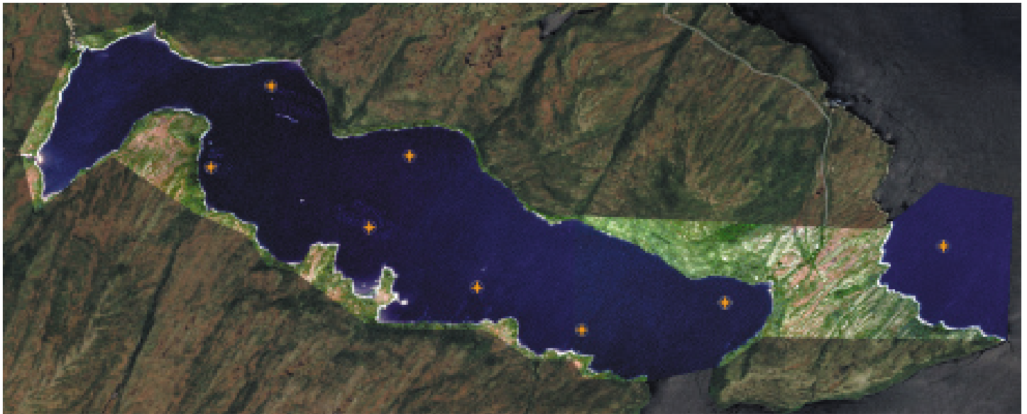
The extent of Maxar imagery for the Roti Bay analysis site. The seven Roti Bay and Hardy Cove licensed aquaculture sites are denoted by the orange crosses.