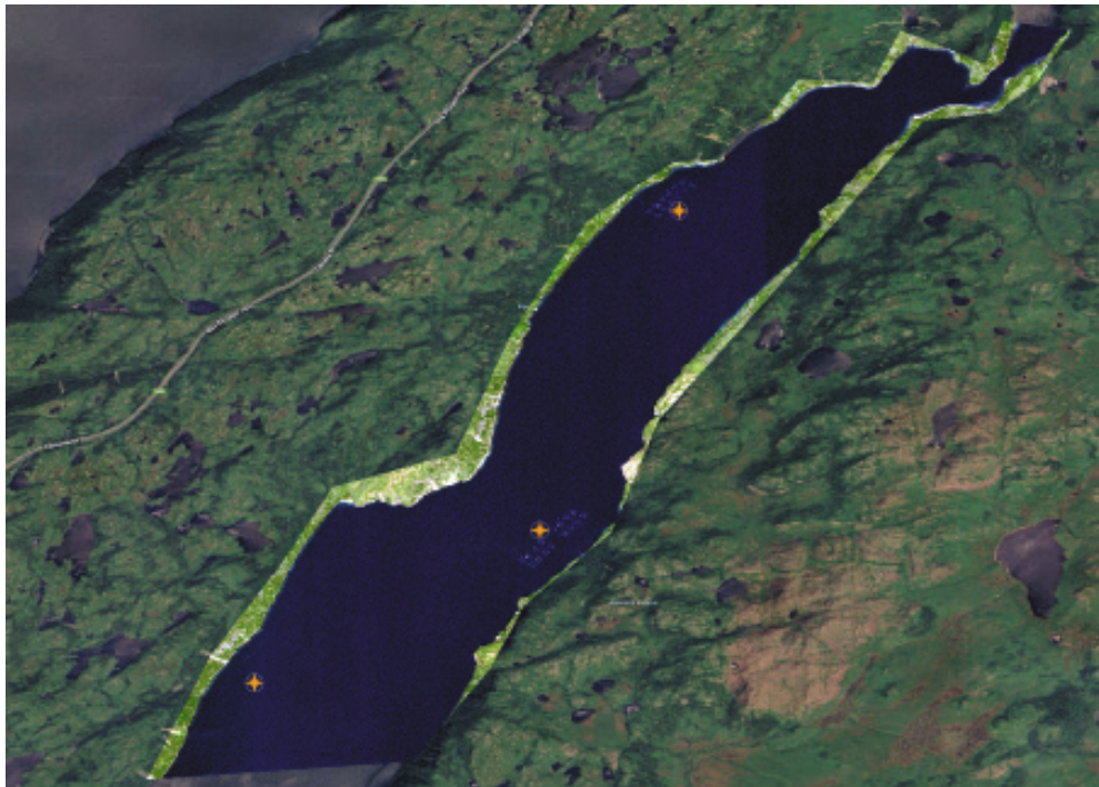
The extent of Maxar imagery for the Harvey Hill analysis site. The three Harvey Hill licensed aquaculture sites are denoted by the orange crosses.