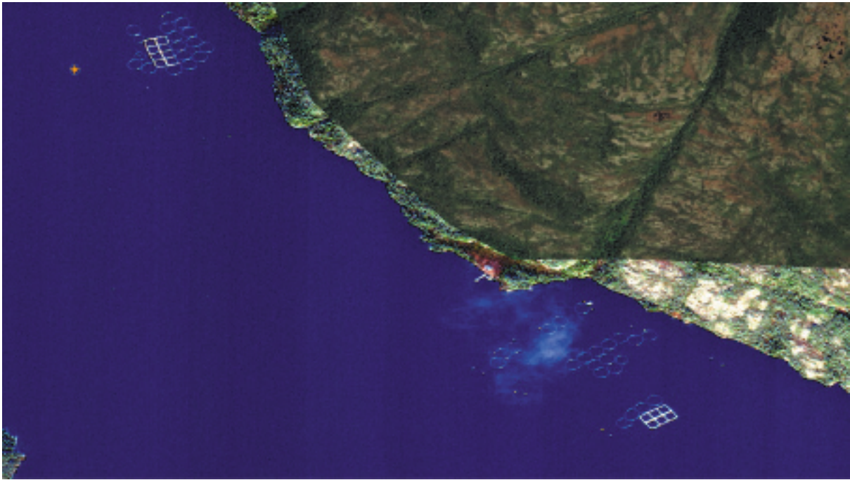
Grid structures present amongst discarded rings at Roti Bay #4 and further down the Bay.