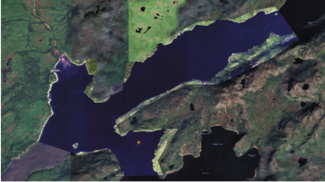
The extent of Maxar imagery for the Dog Cove analysis site. The Dog Cove licensed aquaculture site is denoted by the orange cross.